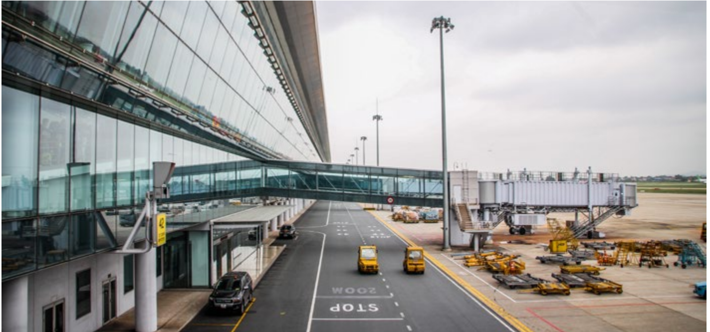
A holistic airport design takes airside operations into account in all other areas.

When the same experts are involved with each phase of the project, there is no learning curve when moving on to a subsequent phase. It allows for total coordination. There is no need for the usual time the terminal architects would take to understand the site, the aircraft parking, the terminal roadways, etc. This is one reason why I have been fortunate to support many of the same clients — they know it can be more efficient to hire an architect for an airport project who has experience in this type of facility design and operation.