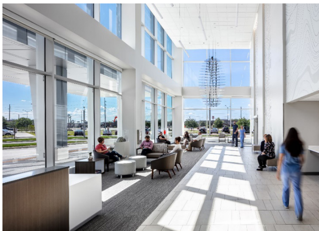
Marshfield Medical Center Lobby, Eau Claire, WI

This is a constant balance of needs versus wants. On-call rooms are critical in making sure that staff are available for patient care, especially in more rural sites. However, finding the balance in the right complement of rooms, relative to a small number of initial inpatient beds, is always a discussion point. Sharing staff lounges between a few adjacent departments is becoming more commonplace, but there are often still silos where expectations may not align with that model. Similarly, more and more health systems are standardizing their office approach to define who needs a private office and where hoteling or touchdown spaces will suffice. Modest lobbies contribute to ease of wayfinding, infiltration of natural light and may bolster the patient experience, but they must be balanced with HVAC, fire code implications and cost.