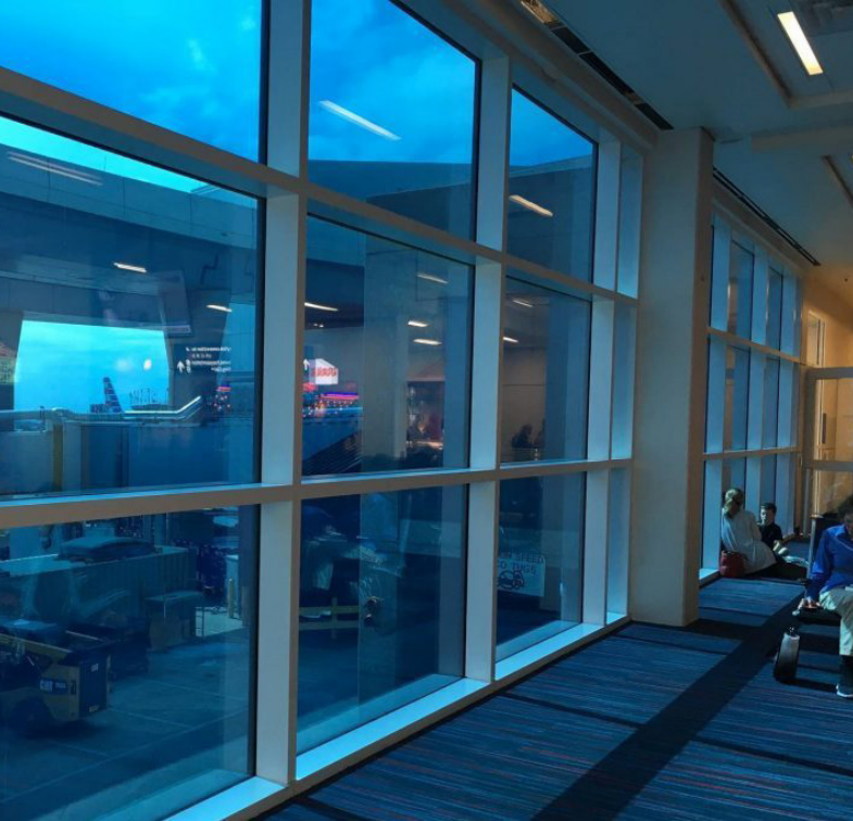
Dynamic glass windows installed in a terminal at Dallas Fort Worth International Airport.

These goals can and should be ambitious, but they also must include actionable metrics for success. Ambitious sustainability goals that are above and beyond IATA's goal to achieve NetZero carbon by 2050 can include: