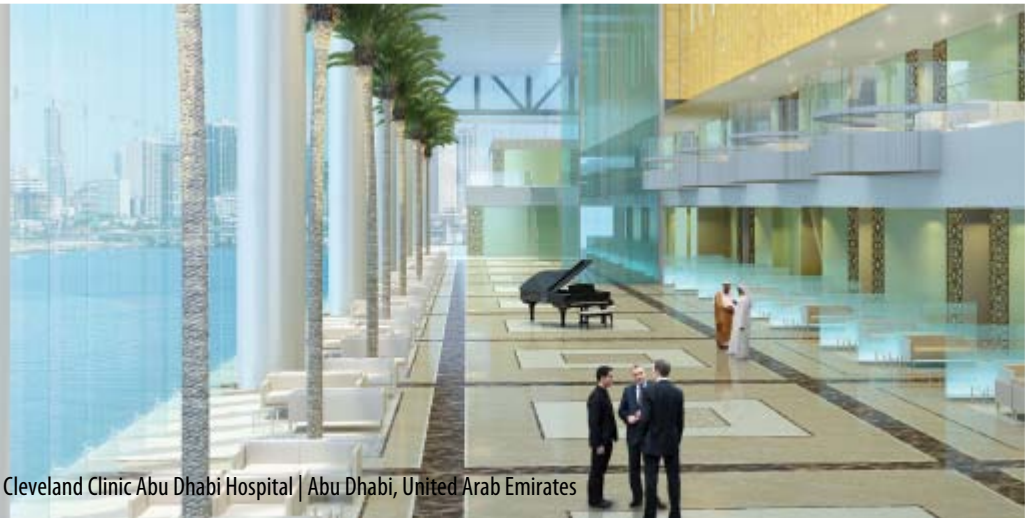
Cleveland Clinic Abu Dhabi Hospital | Abu Dhabi, United Arab Emirates