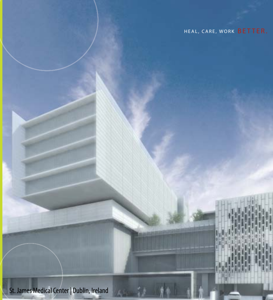
St. James Medical Center | Dublin, Ireland