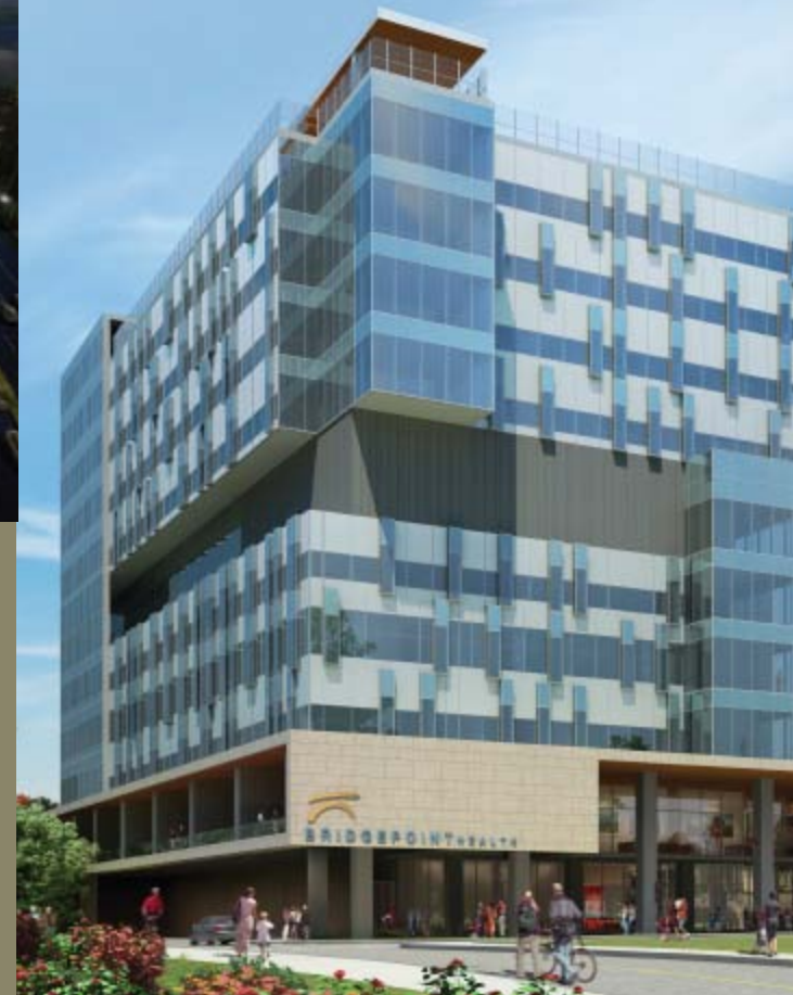
Bridgepoint Hospital | Toronto, Ontario, Canada