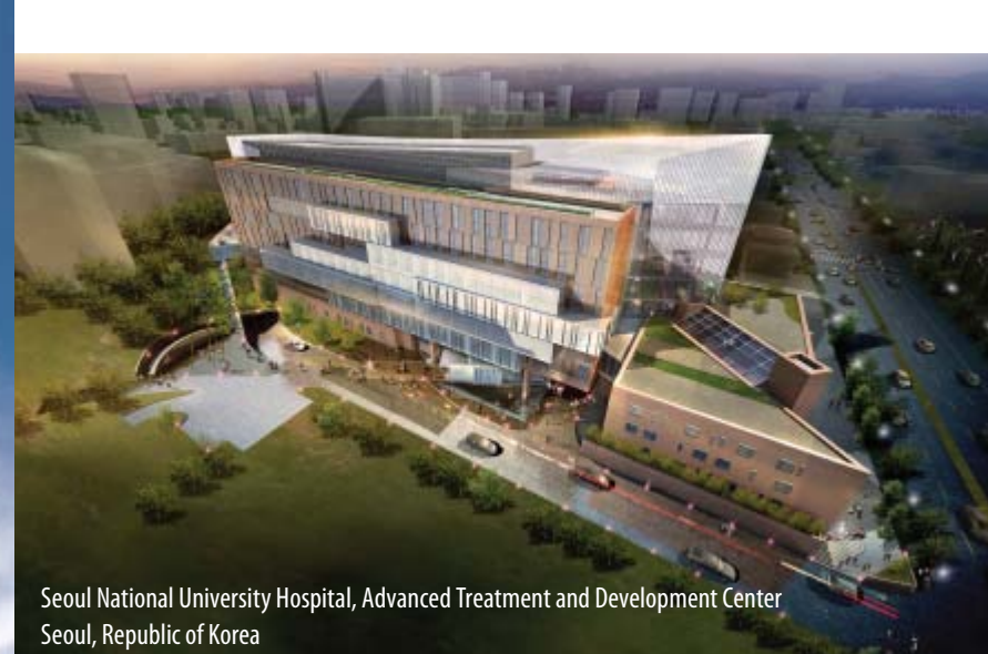
Seoul National University Hospital, Advanced Treatment and Development Center Seoul, Republic of Korea