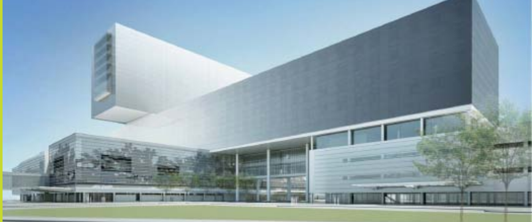
Parkland Health & Hospital System | Dallas, Texas