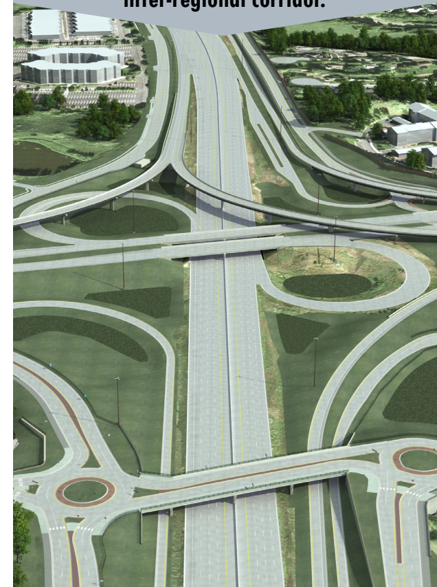
US 169/494 Interchange (MnDOT)

Working together to enhance safety, reduce congestion, and maximize economic development along the US Highway 169 inter-regional corridor.