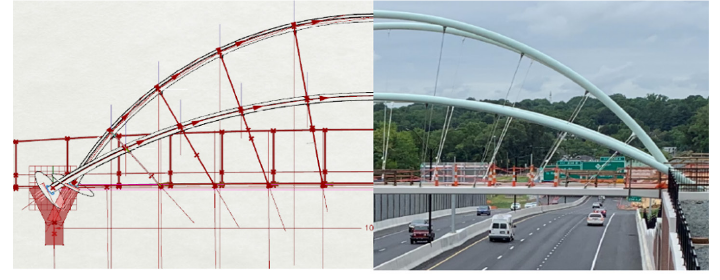
The Green Street tied arch bridge in Winston-Salem, North Carolina.

design challenges efficiently. What was conceptualized during the procurement phase is effectively what's been built. This demonstrates the proof-of-concepting advantages gained directly from parametric design at the early stages when decisions are paramount and have the greatest impact on a project's cost. Our approach was key to delivering the aesthetic vision the client and community sought under challenging constraints without deviating from the RFP.